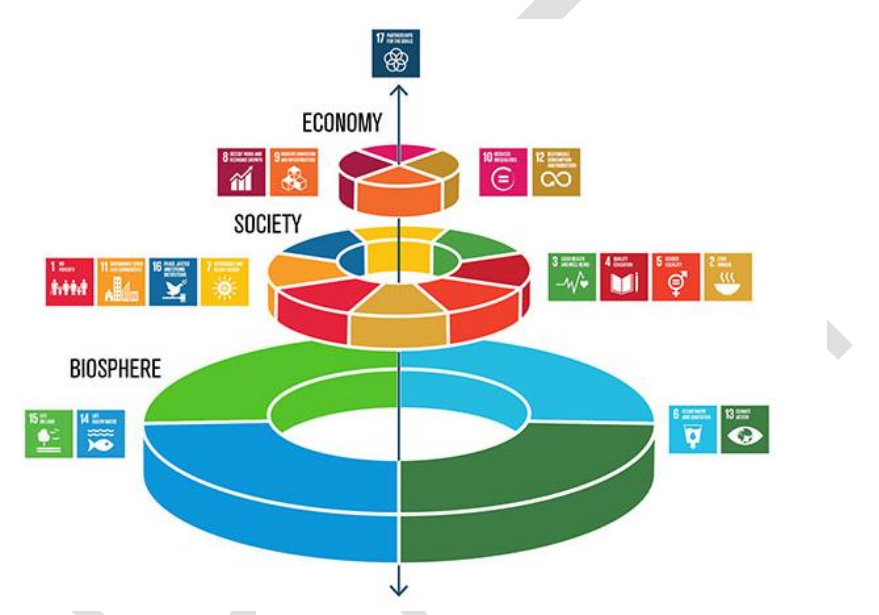
Figure 1: Integration of the 17 SDGs across environment (biosphere), society and economy (Stockholm Resilience Centre<sup>1</sup>)

The 2030 Agenda for sustainability is a plan of action for people, the planet and prosperity. To enable countries to measure progress towards achieving the 2030 Agenda and its 17 Sustainable Development Goals (SDGs), the UN Statistical Commission has endorsed a Global Indicator Framework comprised of 232 SDG Target Indicators. The SDGs and their targets are founded upon addressing the three dimensions of sustainability: The environment (biosphere); society; and, the economy, as shown in Figure 1.