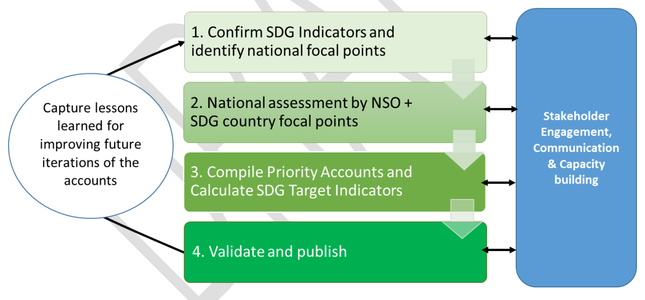
Figure 3: Four steps for compiling SEEA EEA Accounts for calculating selected SDG Target Indicators

The intention of this chapter is to provide a useful introductory overview to NSOs and other agencies of the various steps that should be considered in implementation of the SEEA EEA for compiling SDG Indicators, as well as links to relevant material and guidance. The four steps set out for this process are presented in Figure 3. As shown in Figure 3, stakeholder engagement and capacity building (in the use and production of the accounts) are key features of compiling accounts for SDGs throughout the process. It is also essential to maintain communication with these stakeholders throughout the process to ensure the compilation of SEEA EEA Accounts that are relevant, credible and legitimate.