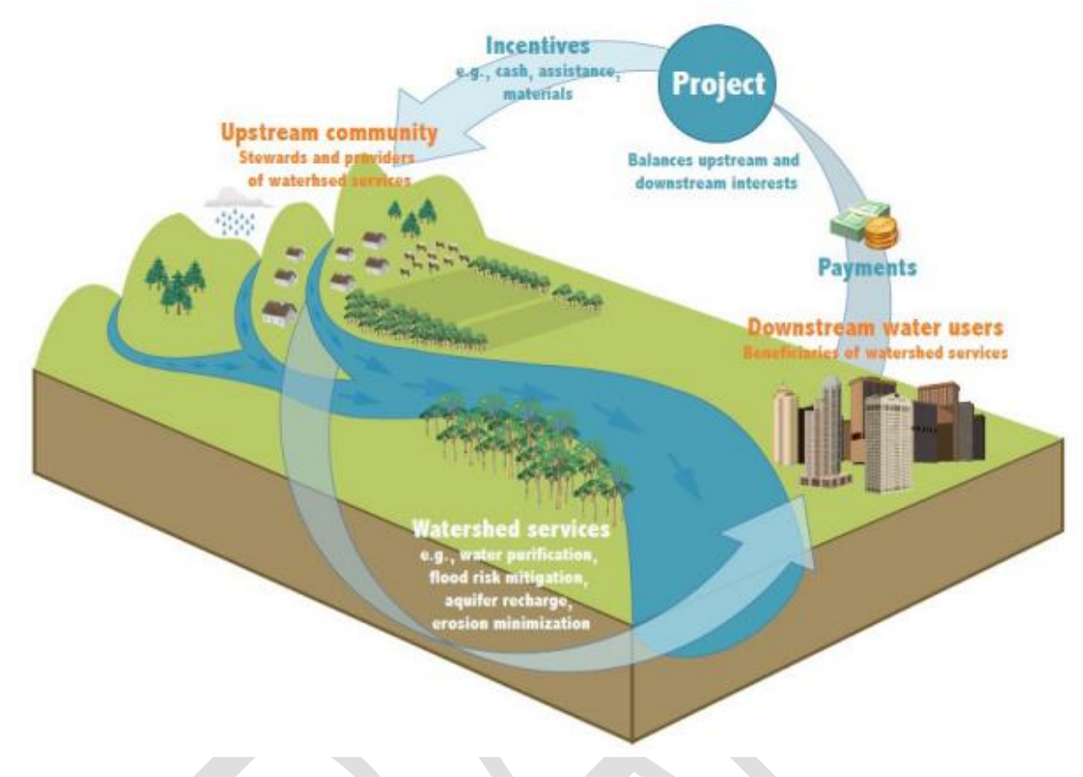
Figure 5: The PES Concept (Defra, 2013)

One of the most famous catchment management programme is from the USA. Where investments in the management of the Catskill Delaware watershed were made in order to avoid the costs of water treatment facilities for the city of New York. Managing the ecosystem offered a significantly cheaper way to improve water quality than end of pipe treatment. However, it did require influencing farmer behaviour to reduce agricultural pollution, so it went beyond simply habitat management and reveals the need for joining up elements and efforts across policy frameworks.<sup>29</sup>