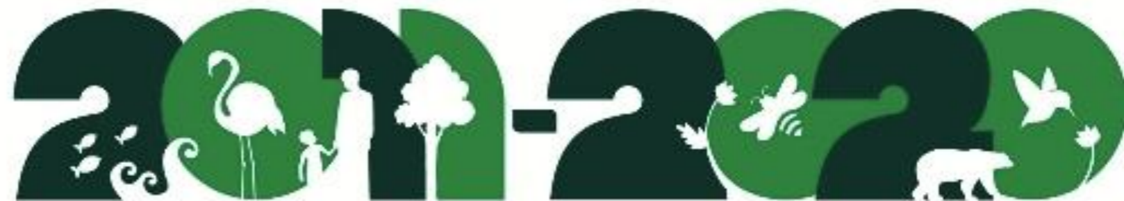
United Nations Decade on Biodiversity