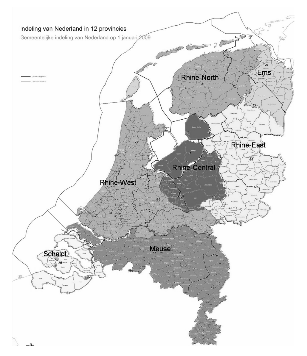
Figure 4.1: Overlay of Municipalities and River Basins (shaded)

The result of this activity is a descriptive table with area fractions of municipalities per (sub-) River Basin per year. For 2008, out of a total of 443 municipalities, 50 municipalities are allocated to two (sub-)River Basins and 2 municipalities are allocated to 3 (sub-)River Basins. The remaining 391 are allocated to just one (sub-) River Basin (fraction = 1).