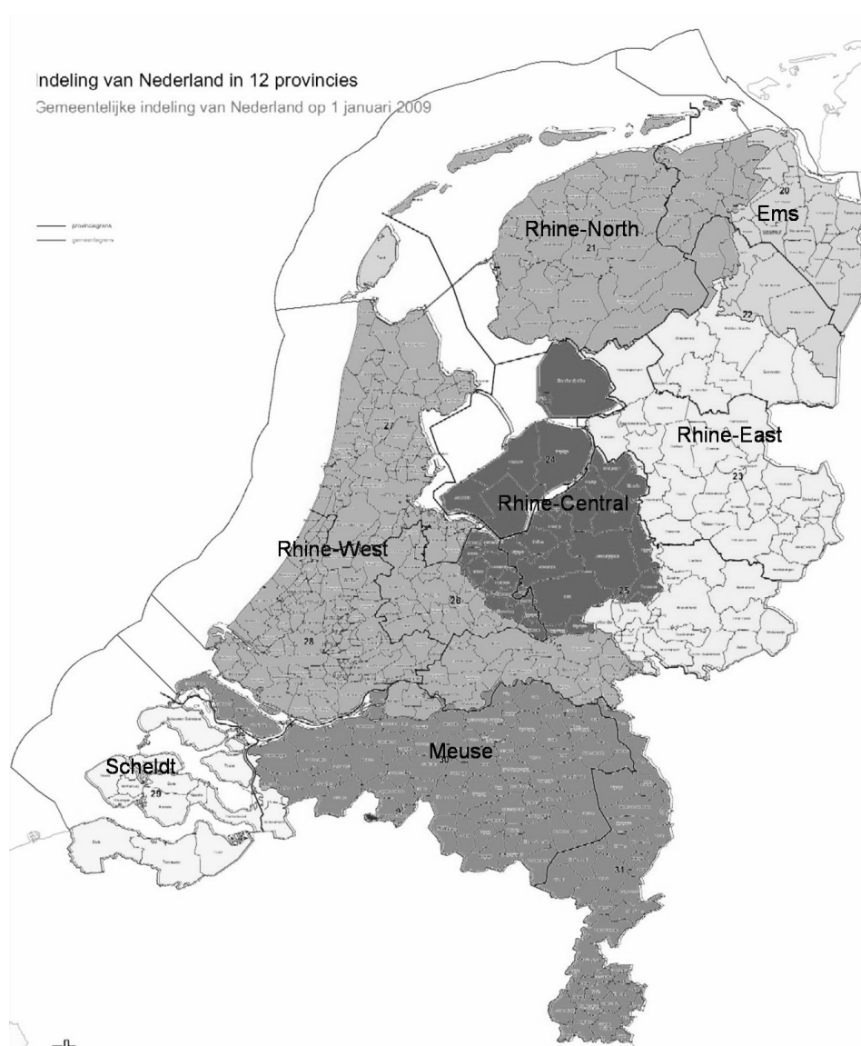
Figure 4.1: Overlay of Municipalities and River Basins (shaded)

The result of this activity is a descriptive table with area fractions of municipalities per (sub-) River Basin per year. For 2008, out of a total of 443 municipalities, 50 municipalities are allocated to two (sub-)River Basins and 2 municipalities are allocated to 3 (sub-)River Basins. The remaining 391 are allocated to just one (sub-) River Basin (fraction = 1).