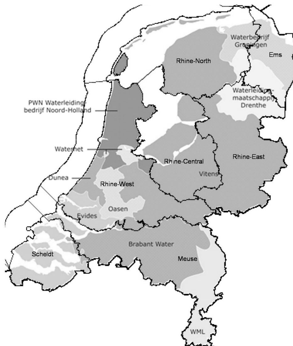
Figure 4.2 Overlay of PWS areas (shaded) with the 7 River basins

Figure 4.2 shows the overlay of PWS areas with River Basins. This map illustrates that 5 of in total 10 PWS companies are situated in more then one River Basin. The largest company (Vitens) is even situated in 5 River Basins.